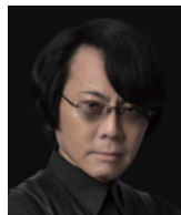
Mr. Hiroshi ISHIGURO