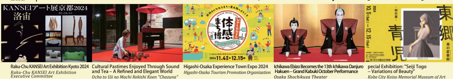
Raku-Chu KANSEI Art Exhibition Kyoto 2024 Raku-Chu KANSEI Art Exhibition Executive Committee